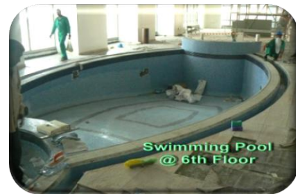
Swimming Pool @ 6th Floor