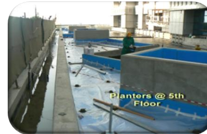
Planters @ 5th Floor