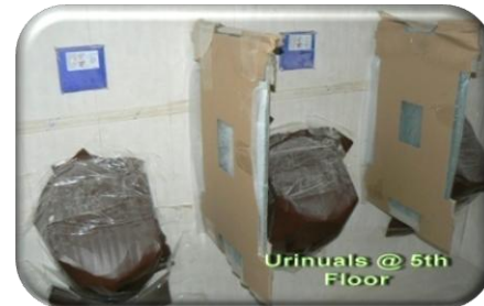
Urinals @ 5th Floor