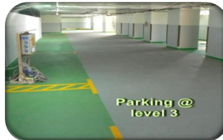
Parking @ level 3