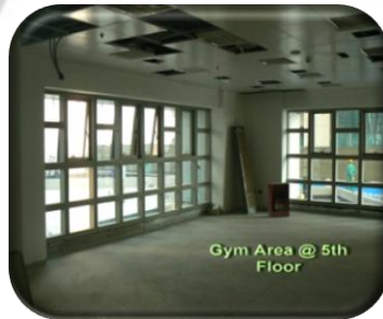
Gym Area @ 5th Floor