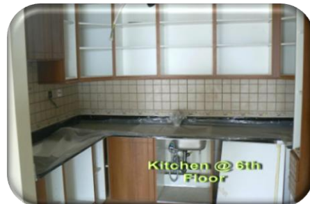
Kitchen @ 5th Floor