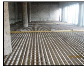
Work for High Level Slab