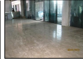
Ceramic Work for Arcade Area