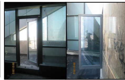
Aluminum Door for Balcony 20th – 31st Floor