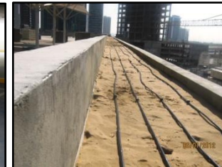
Irrigation Work for Landscape at 5 th Floor