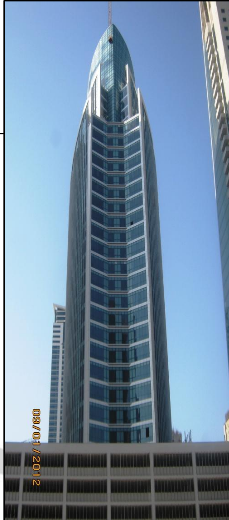
External Façade showing the progress of Cladding