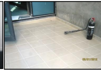
Ceramic Work for Balcony 20th – 31st Floor