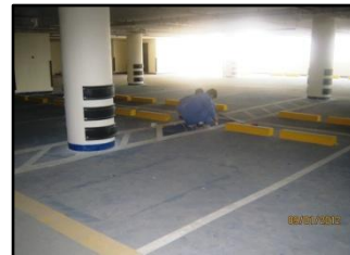
Road Marking & Numbering for Parking Area