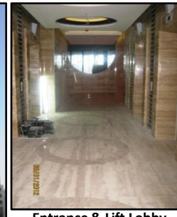
Entrance & Lift Lobby at Ground Floor