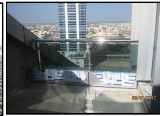
Handrail Fixing for Balcony