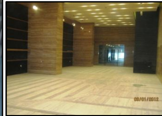
Entrance & Lift Lobby at Ground Floor