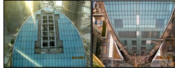
Upper roof external cladding progress