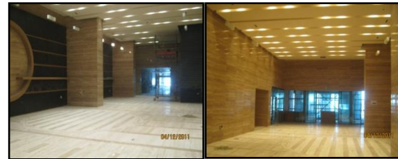
Reception at Ground Floor