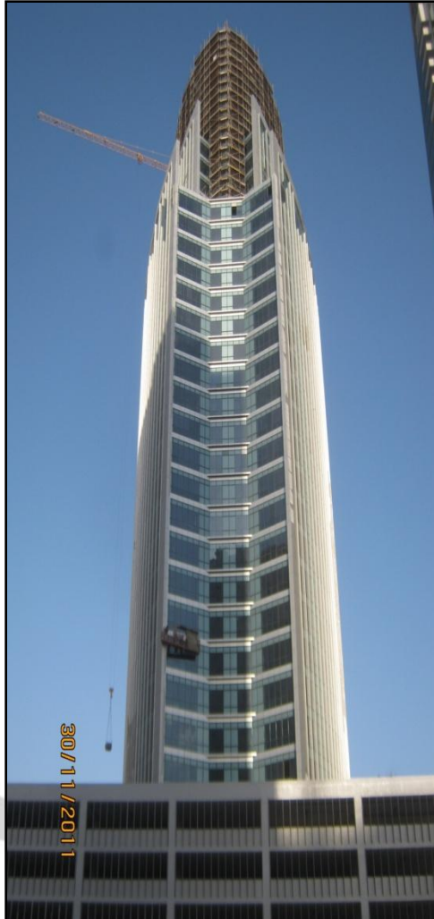
External Façade showing the progress of Cladding