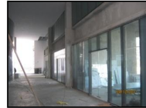
Internal Glass Cladding for the GF Retail & Cafeteria Areas