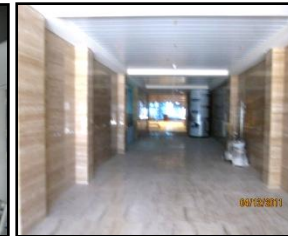
False Ceiling at Ground Floor back entrance