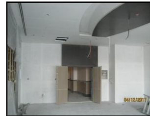
Multifunction halls at the 5 th floor