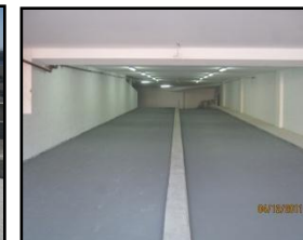
Epoxy Flooring at Parking Area