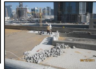
Interlock Paving Fixing at 5 th Floor