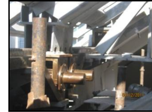
Roof Sliding Door